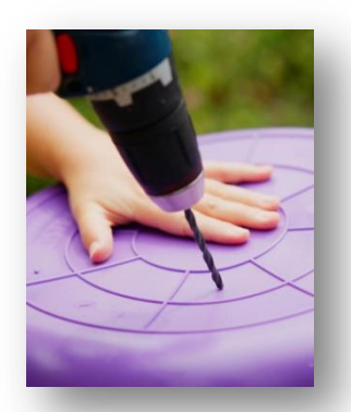
Step 2: Pick A Pot

Ensure your pot has drainage holes or create your own if necessary. Drainage holes are very important to prevent root rot or overwatering. Pot size is another important factor. The diameter and depth will determine how many plants you can use. Leave room for plant growth and do not overcrowd it. Make sure your pot is deep enough so their roots have room to grow as well. The larger the pot the more moisture it holds.